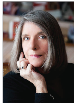
Janet Burroway Essay Judge

Essay Judge Janet Burroway is a playwright, essayist and the author of eight novels including The Buzzards , Raw Silk , Opening Nights , Cutting Stone , and the 2009 Bridge of Sand . Her memoir Losing Tim appeared in 2014. Her textbook Writing Fiction will be published in a tenth edition by the University of Chicago Press in spring of 2019. She is Robert O. Lawton Distinguished Professor Emerita at the Florida State University and recipient of the 2014 Lifetime Achievement in Writing Award by the Florida Humanities Council.